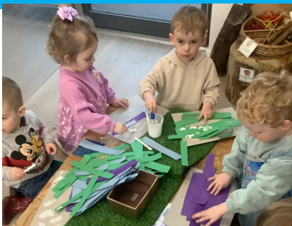
One of our parents is a Firefighter and brought the Fire Engine down for a visit