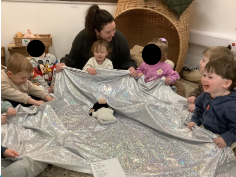
Acorn Room have been creating tartan pictures for Burns Day