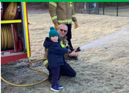
3-5 Children have been working hard in our Woodwork Area building lots of creations