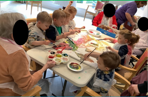
In the Acorn Room they have had experiences linking to Fire Awareness Week